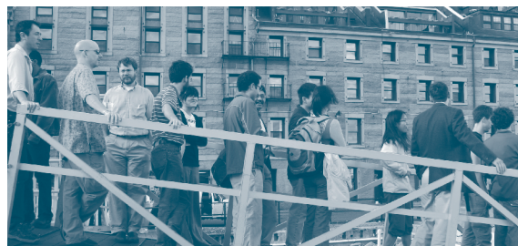
Everyone is waiting patiently to board the ship for the 2004 cruise