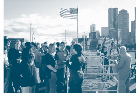
Everyone is on deck as the fall cruise sets sail

continued from page 2 BCS Welcomes New Grad Students