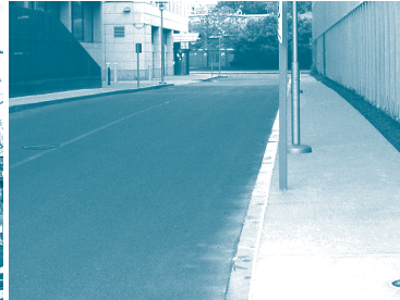
Cluttered or not cluttered? Now your computer can decide for you.