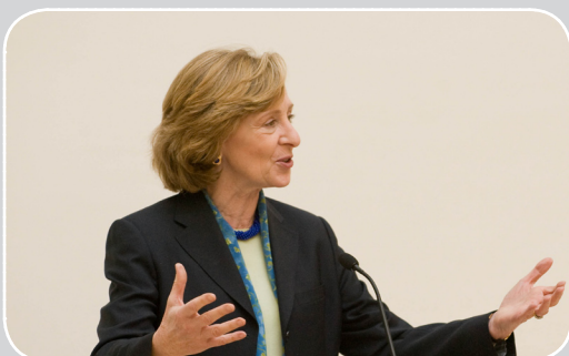
President Susan Hockfield addresses the MIT Corporation and guests at the dedication

In recognition of an extraordinary gift given in support of BCS graduate fellowships, the BCS auditorium was renamed to honor the Singleton family that made the gift.