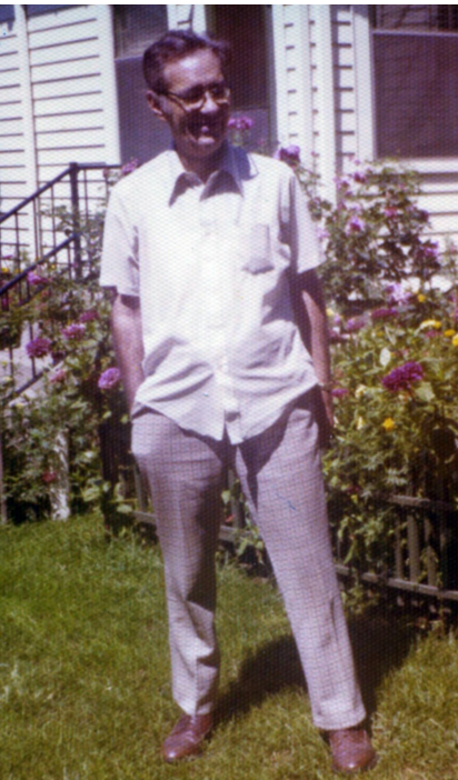
H.M. in front of his family's home 20 years after the operation